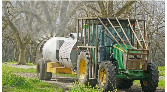
Each tree is sprayed without operator intervention. The system stops when no tree is detected.