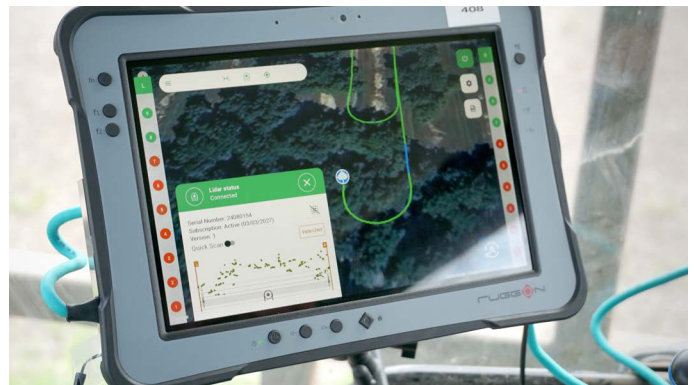
System creates and archives a digital document on chemical savings, tree counts, rows/tracts sprayed and more.